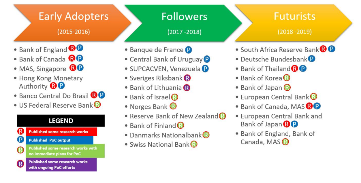
Figure 1: CBDC Experiment Landscape